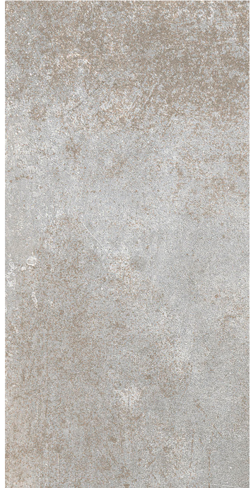
30 x 60 cm (12 x 24) RD.RM.STL.1224

All items shown in this document are part of Olympia's stocking program. For special orders, please contact your Olympia Tile Sales Representative.