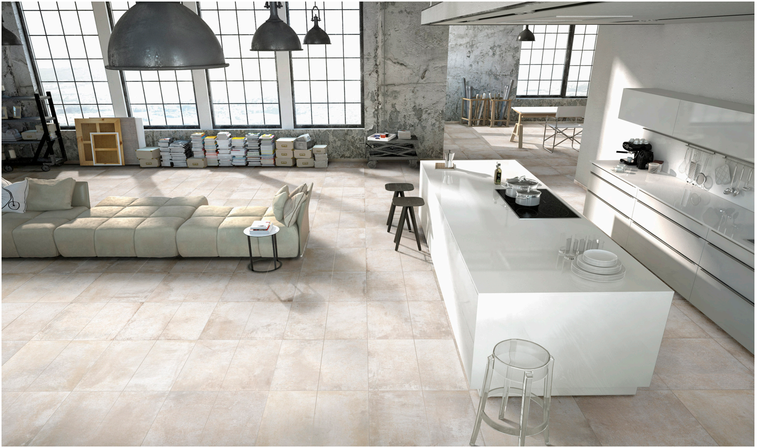
DUST (Off White)