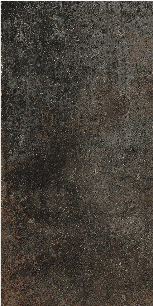
30 x 60 cm (12 x 24) RD.RM.COA.1224

All items shown in this document are part of Olympia's stocking program. For special orders, please contact your Olympia Tile Sales Representative.