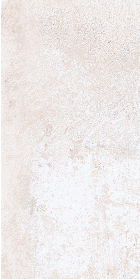
30 x 60 cm (12 x 24) RD.RM.DST.1224