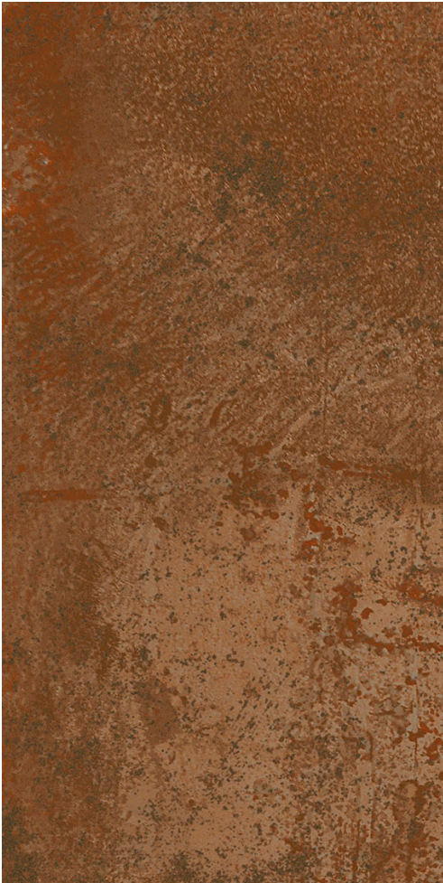
30 x 60 cm (12 x 24) RD.RM.CTN.1224