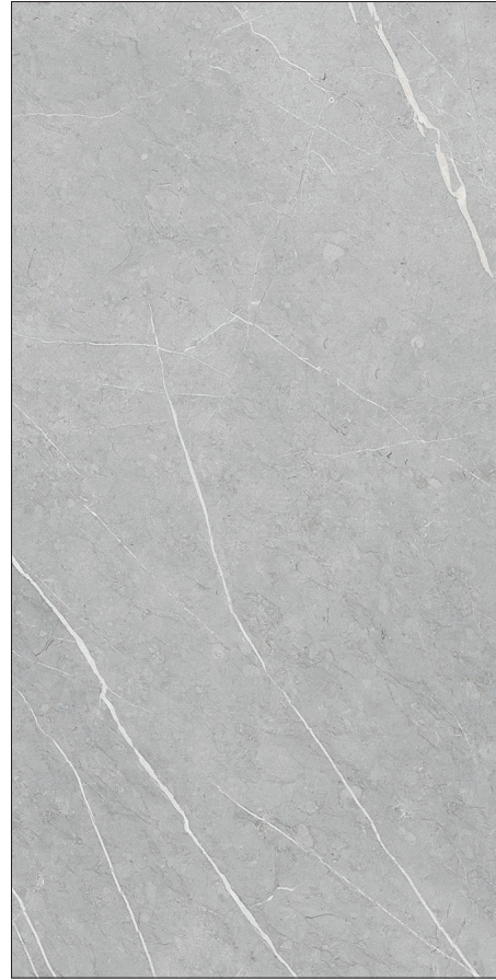
45 x 90 cm (18 x 36) Semi-Polished Finish Rectified EX.PS.LGR.1836.SP

All items shown in this document are part of Olympia's stocking program. For special orders, please contact your Olympia Tile Sales Representative.