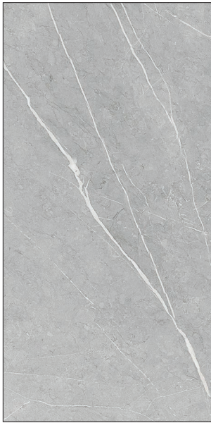
30 x 60 cm (12 x 24) Matte Finish EX.PS.LGR.1224.MT