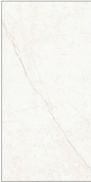
30 x 60 cm (12 x 24) Matte Finish Rectified EX.PS.WHT.1224.MTREC