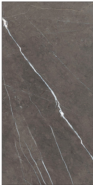
30 x 60 cm (12 x 24) Matte Finish EX.PS.DGR.1224.MT