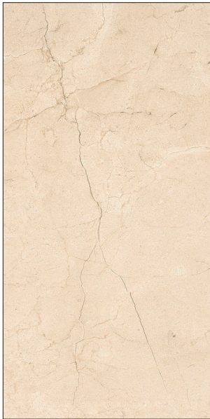
30 x 60 cm (12 x 24) Matte Finish EX.PS.MFL.1224.MT