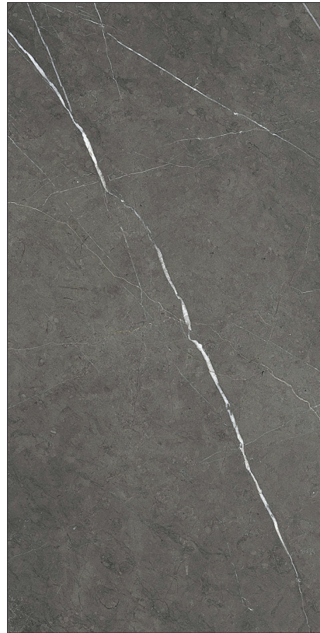
45 x 90 cm (18 x 36) Semi-Polished Finish Rectified EX.PS.DGR.1836.SP