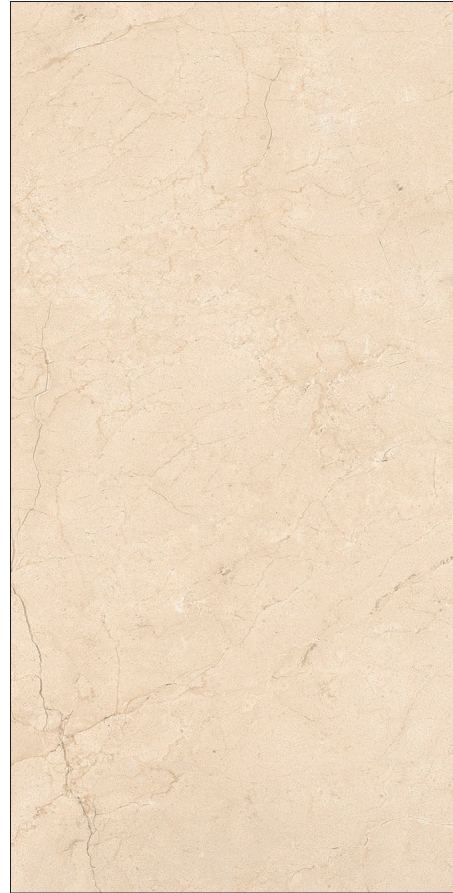
45 x 90 cm (18 x 36) Semi-Polished Finish Rectified EX.PS.MFL.1836.SP

All items shown in this document are part of Olympia's stocking program. For special orders, please contact your Olympia Tile Sales Representative.