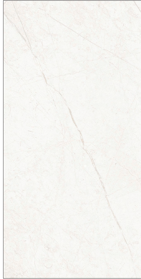
45 x 90 cm (18 x 36) Semi-Polished Finish Rectified EX.PS.WHT.1836.SP

All items shown in this document are part of Olympia's stocking program. For special orders, please contact your Olympia Tile Sales Representative.