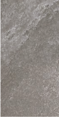
30 x 60 cm (12 x 24) SO.ST.GRY.1224.MT