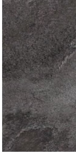
30 x 60 cm (12 x 24) SO.ST.DRK.1224.MT

All items shown in this document are part of Olympia's stocking program. For special orders, please contact your Olympia Tile Sales Representative.