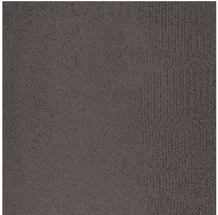
75 x 75 cm (29.53 x 29.53) OE.KV.GRF.3030

All items shown in this document are part of Olympia's stocking program. For special orders, please contact your Olympia Tile Sales Representative.