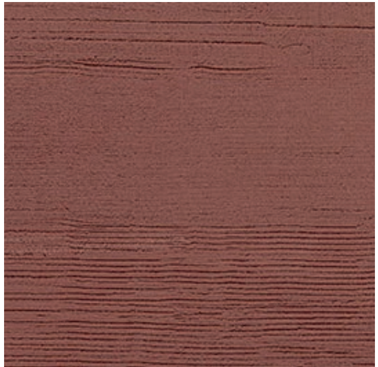
75 x 75 cm (29.53 x 29.53) OE.KV.MSA.3030

All items shown in this document are part of Olympia's stocking program. For special orders, please contact your Olympia Tile Sales Representative.