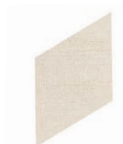
14 x 24 cm (5.5 x 9.5) OE.KV.LNO.0610.ROMBO