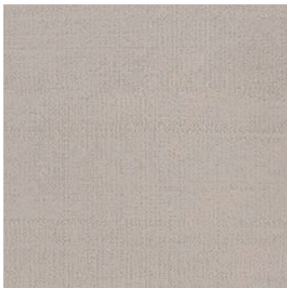
60 x 60 cm (23.6 x 23.6) OE.KV.CNR.2424