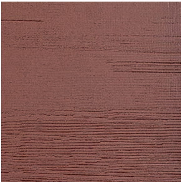
60 x 60 cm (23.6 x 23.6) OE.KV.MSA.2424