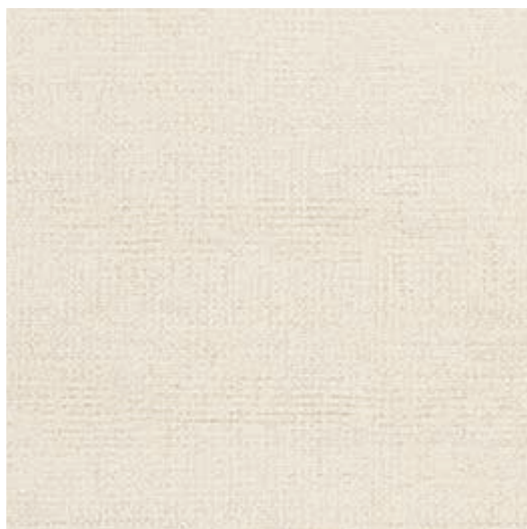
60 x 60 cm (23.6 x 23.6) OE.KV.LNO.2424