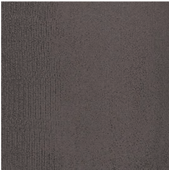
60 x 60 cm (23.6 x 23.6) OE.KV.GRF.2424