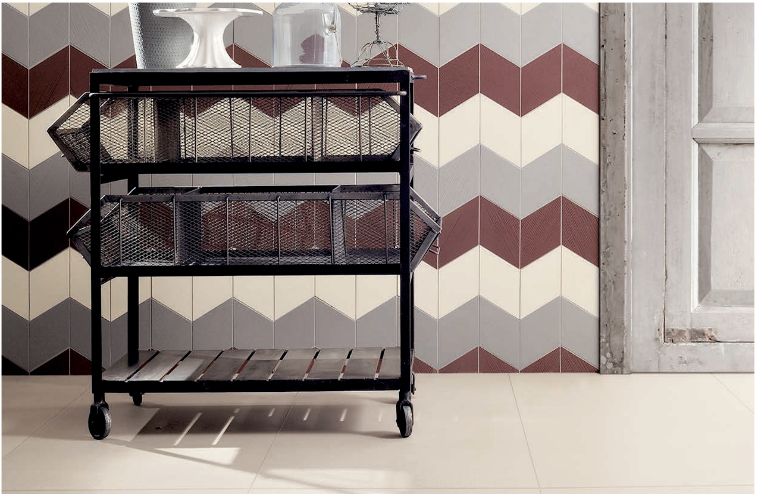
Wall (Rombo): CENERE (Grey), MARSALA (Burgundy) LINO (White) Floor: IUTA (Taupe)