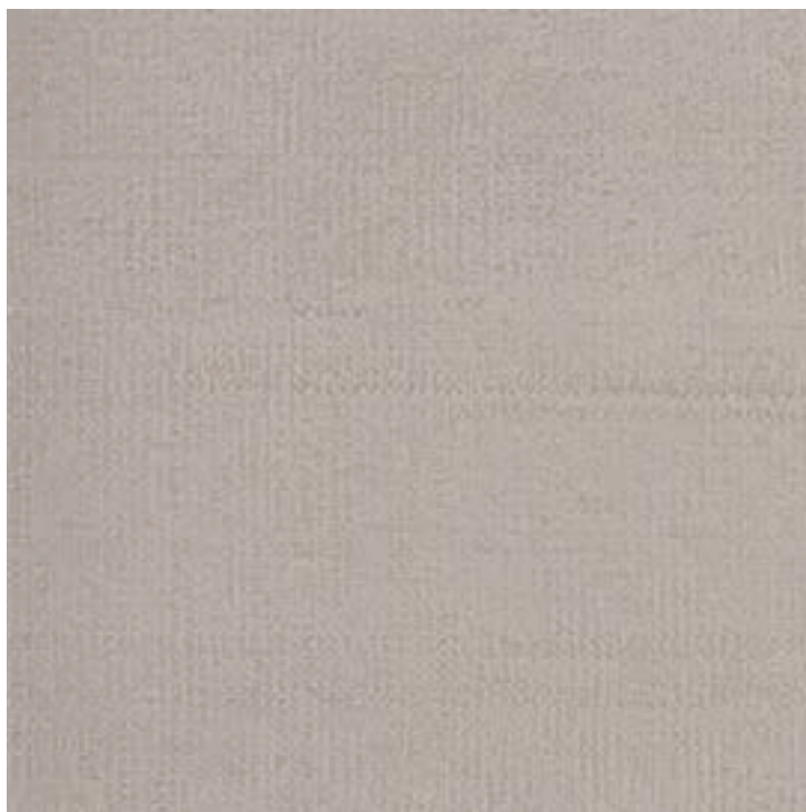
75 x 75 cm (29.53 x 29.53) OE.KV.CNR.3030

All items shown in this document are part of Olympia's stocking program. For special orders, please contact your Olympia Tile Sales Representative.