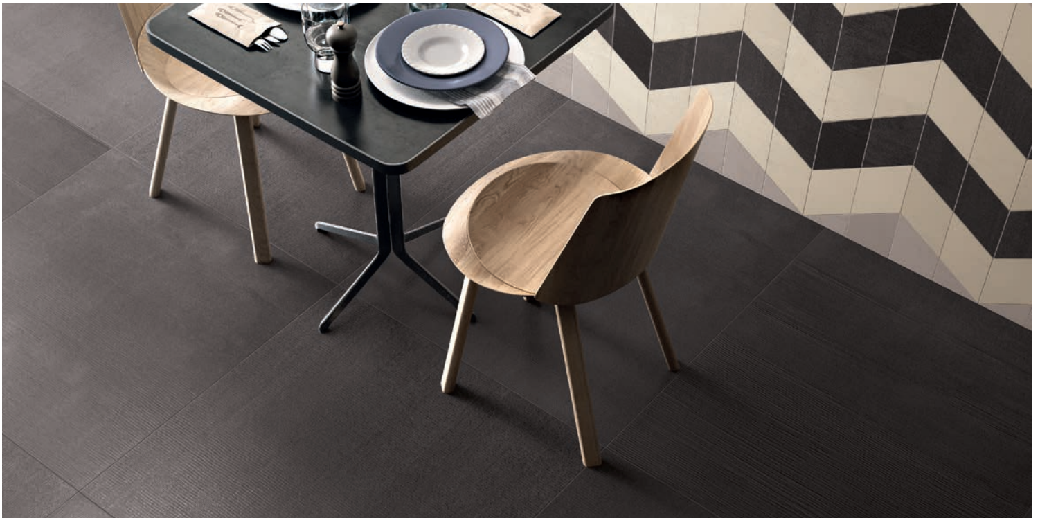
Wall (Rombo): GRAFITE (Charcoal), LINO (White) & CENERE (Grey) Floor: GRAFITE (Charcoal)