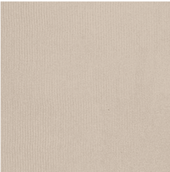
60 x 60 cm (23.6 x 23.6) OE.KV.ITA.2424