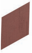
14 x 24 cm (5.5 x 9.5) OE.KV.MSA.0610.ROMBO