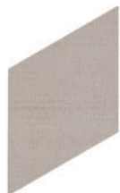
14 x 24 cm (5.5 x 9.5) OE.KV.CNR.0610.ROMBO