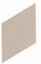
14 x 24 cm (5.5 x 9.5) OE.KV.ITA.0610.ROMBO