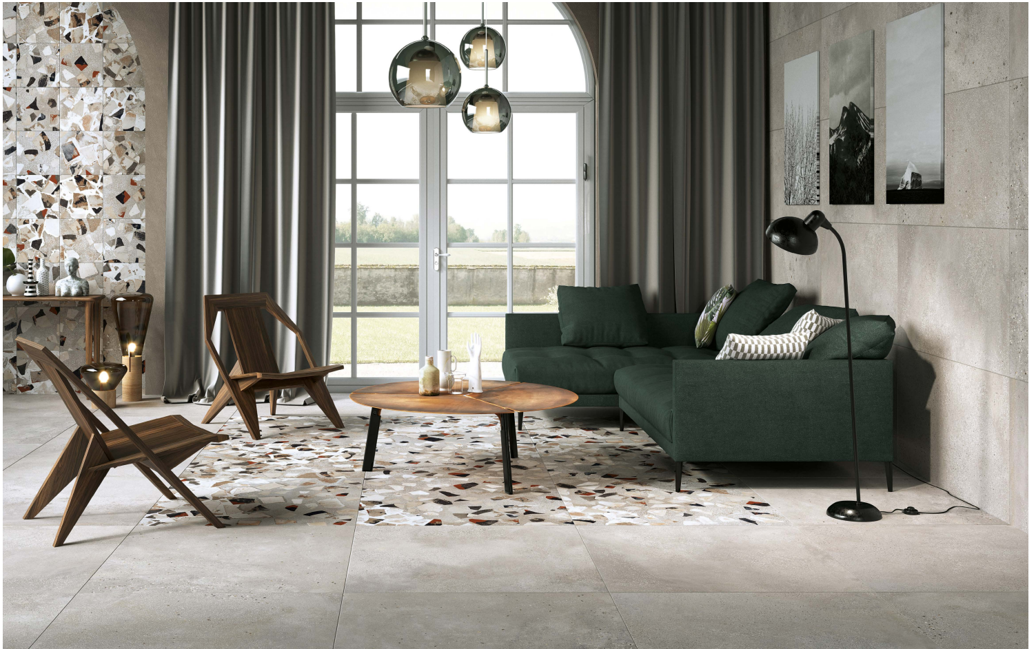
CENERE (Grey) & CENERE (Grey) Decor