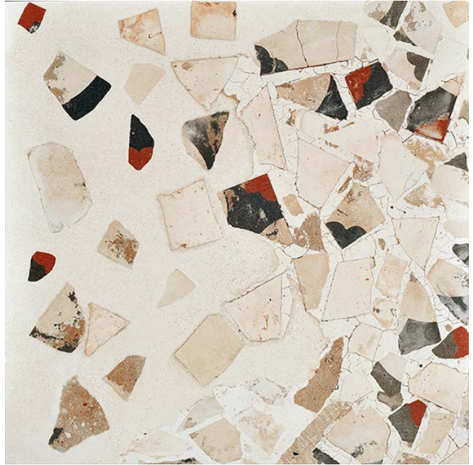
90 x 90 cm (36 x 36) OE.IC.CLE.3636.MTDCN Thickness: 9mm

All items shown in this document are part of Olympia's stocking program. For special orders, please contact your Olympia Tile Sales Representative.