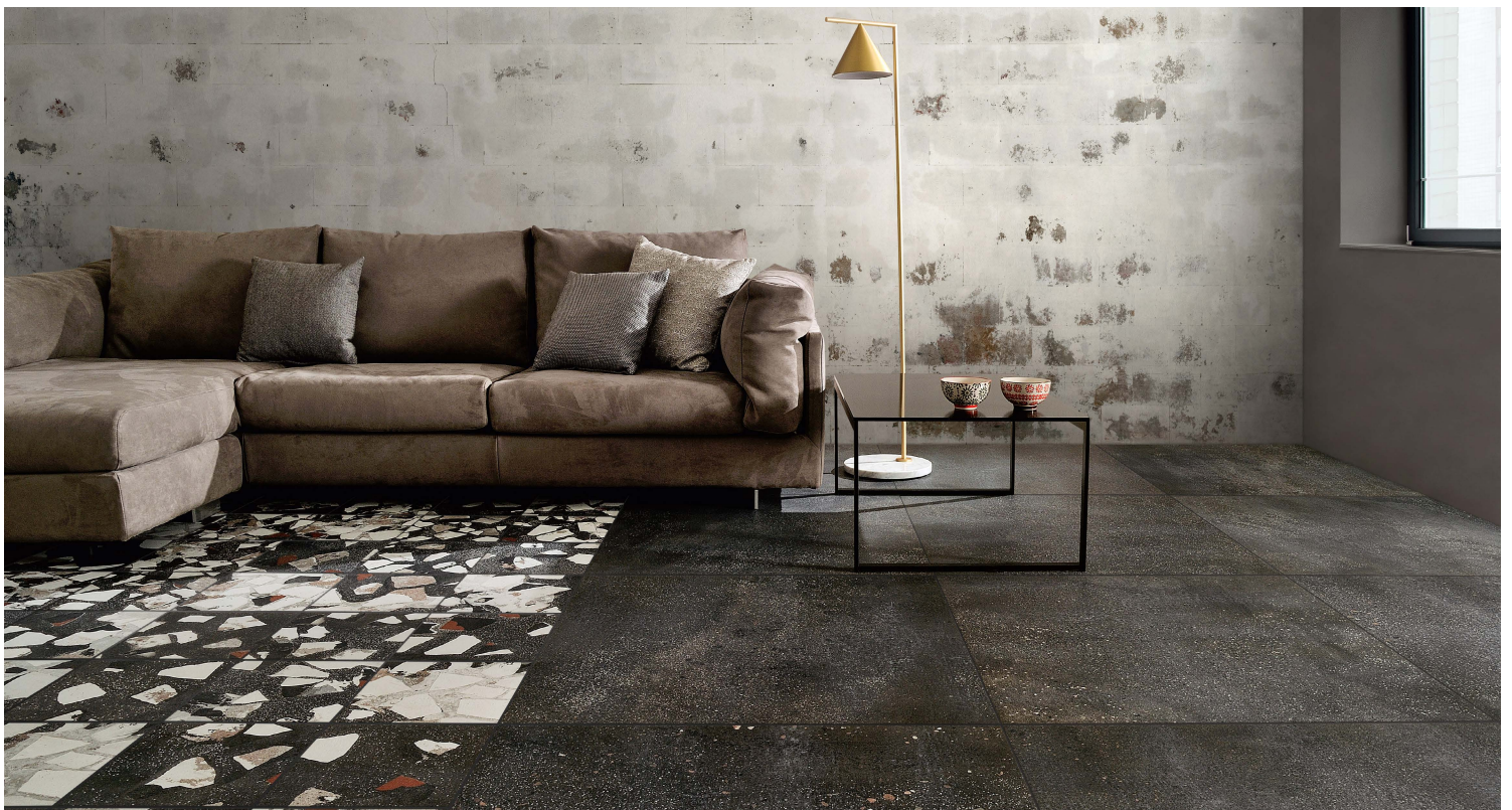
GRAFITE (Black) & GRAFITE (Black) Decor