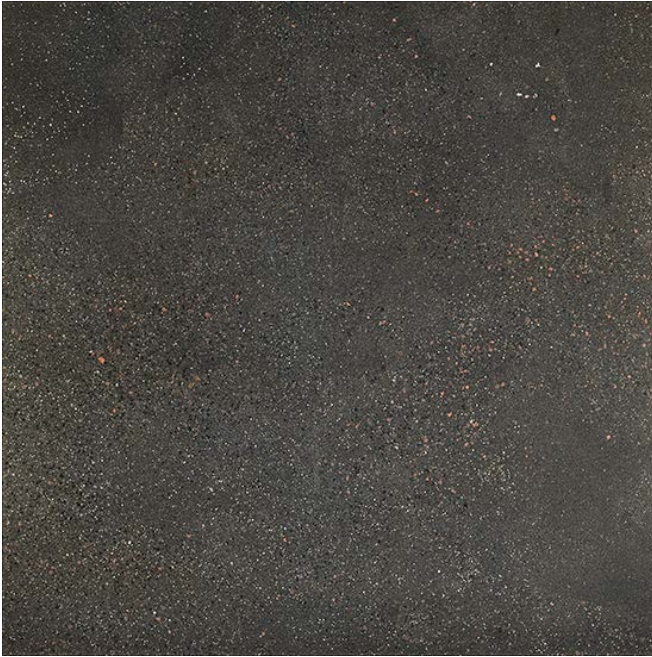
90 x 90 cm (36 x 36) OE.IC.GFT.3636.MT.N Thickness: 9mm