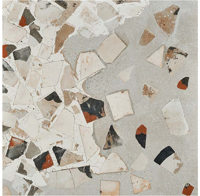
90 x 90 cm (36 x 36) OE.IC.CNR.3636.MTDCN Thickness: 9mm

All items shown in this document are part of Olympia's stocking program. For special orders, please contact your Olympia Tile Sales Representative.