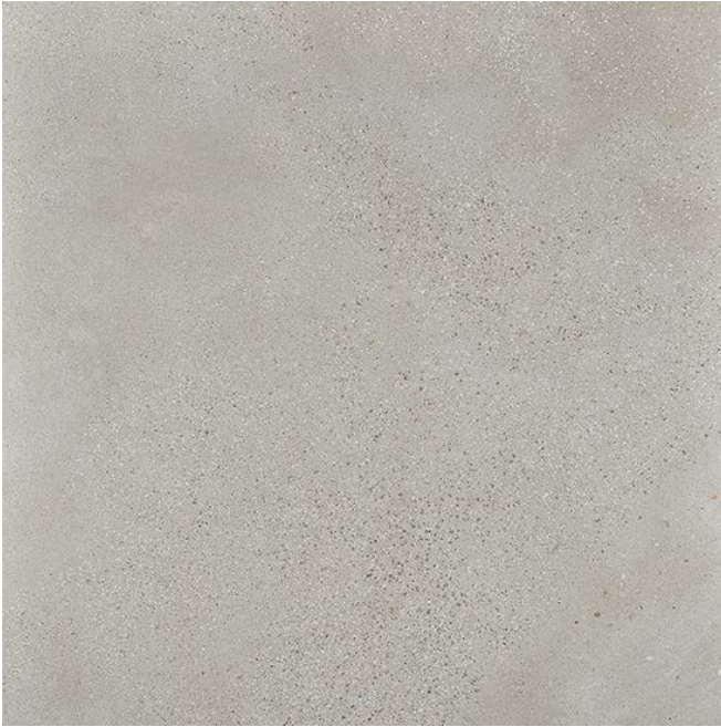
90 x 90 cm (36 x 36) OE.IC.CNR.3636.MT.N Thickness: 9mm