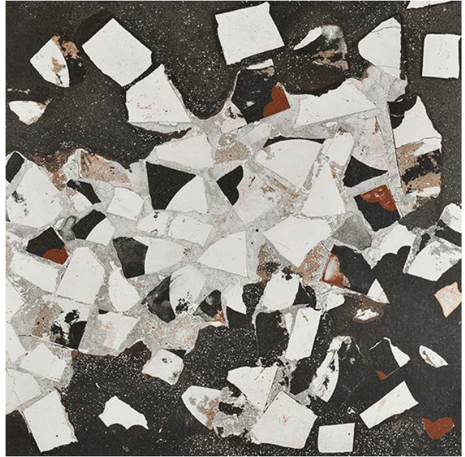
90 x 90 cm (36 x 36) OE.IC.GFT.3636.MTDCN Thickness: 9mm

All items shown in this document are part of Olympia's stocking program. For special orders, please contact your Olympia Tile Sales Representative.