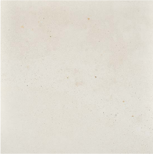
90 x 90 cm (36 x 36) OE.IC.CLE.3636.MT.N Thickness: 9mm