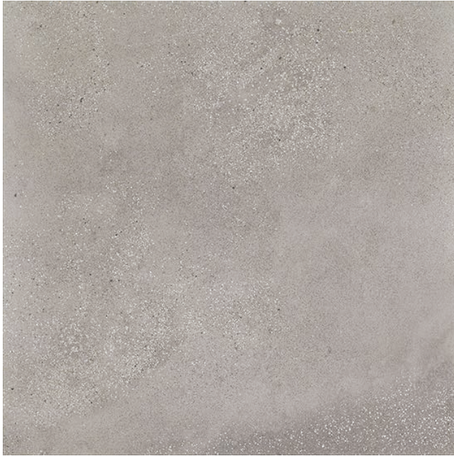
90 x 90 cm (36 x 36) OE.IC.CMT.3636.MT.N Thickness: 9mm