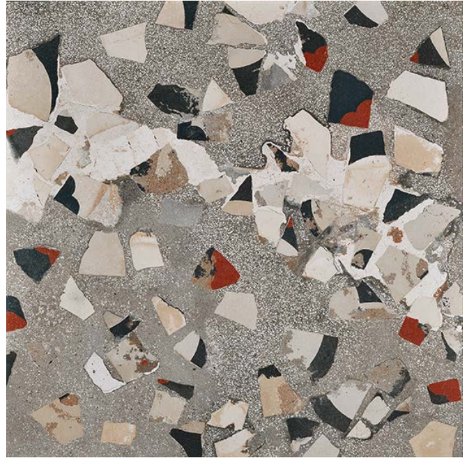
90 x 90 cm (36 x 36) OE.IC.CMT.3636.MTDCN Thickness: 9mm

All items shown in this document are part of Olympia's stocking program. For special orders, please contact your Olympia Tile Sales Representative.