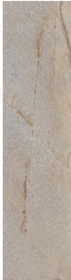
30cm x 120cm (12" x 48") EC.CS.GNS.1248.MT