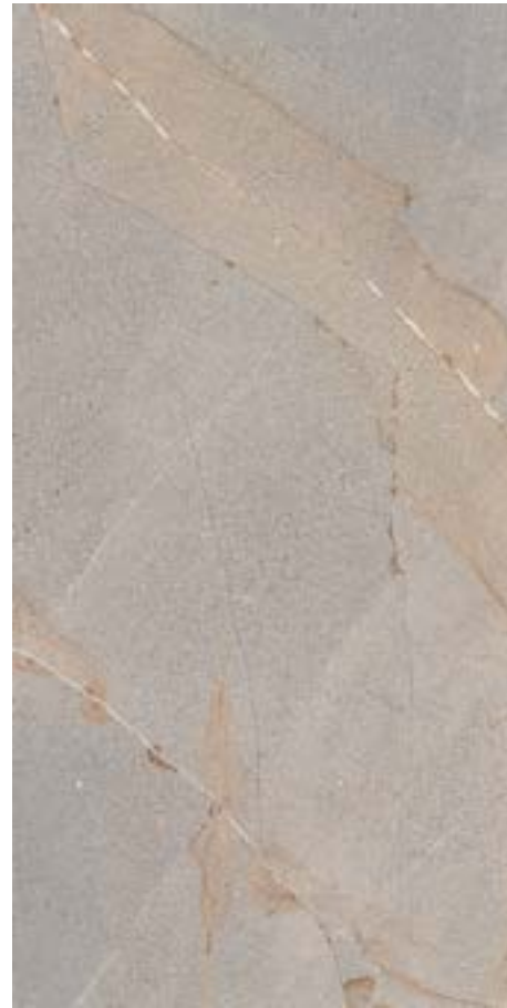
60cm x 120cm (24" x 48") EC.CS.GNS.2448.MT

All items shown in this document are part of Olympia's stocking program. For special orders, please contact your Olympia Tile Sales Representative.