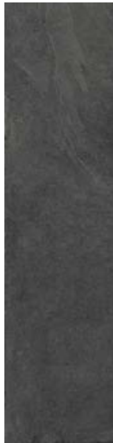
30cm x 120cm (12" x 48") EC.CS.SLB.1248.MT