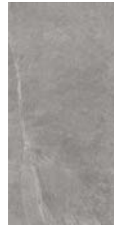
30cm x 60cm (12" x 24") EC.CS.SLG.1224.MT