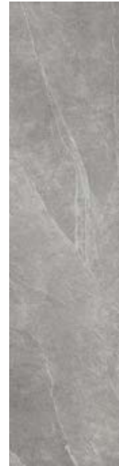
30cm x 120cm (12" x 48") EC.CS.SLG.1248.MT