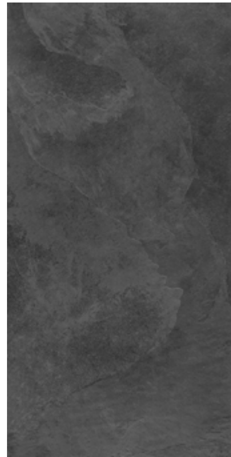
60cm x 120cm (24" x 48") EC.CS.SLB.2448.MT

All items shown in this document are part of Olympia's stocking program. For special orders, please contact your Olympia Tile Sales Representative.