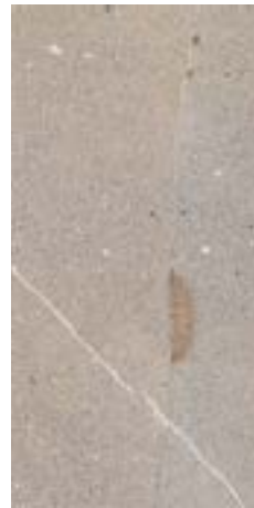
30cm x 60cm (12" x 24") EC.CS.GNS.1224.MT