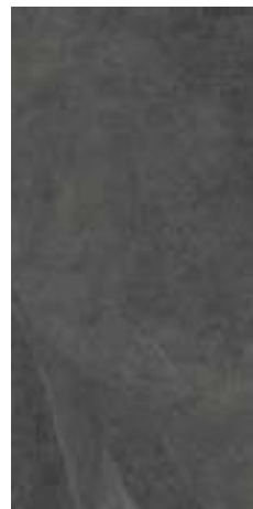
30cm x 60cm (12" x 24") EC.CS.SLB.1224.MT