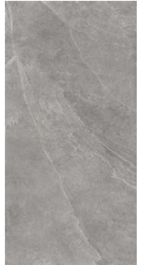
60cm x 120cm (24" x 48") EC.CS.SLG.2448.MT

All items shown in this document are part of Olympia's stocking program. For special orders, please contact your Olympia Tile Sales Representative.