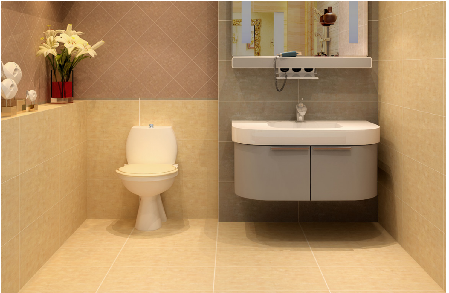
BEIGE / GREY