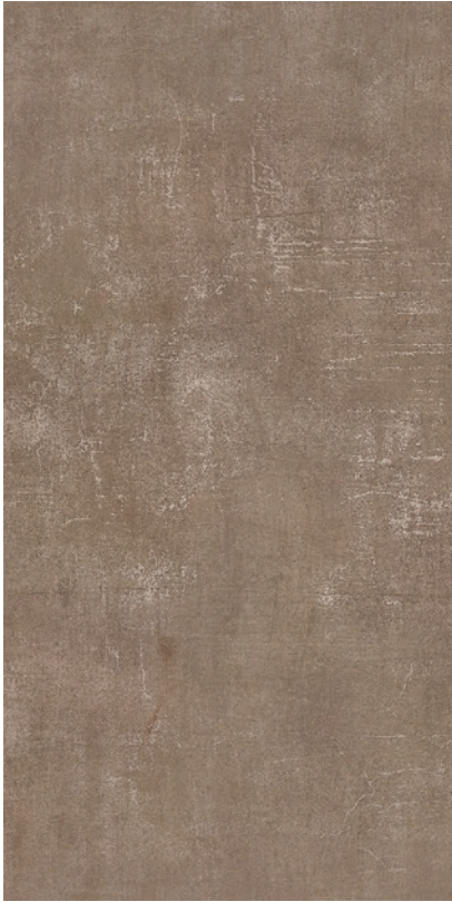
30cm x 60cm (12" x 24") OV.CY.NCE.1224