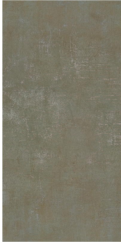
30cm x 60cm (12" x 24") OV.CY.OLV.1224 60cm x 60cm (24" x 24") OV.CY.OLV.2424

All items shown in this document are part of Olympia's stocking program. For special orders, please contact your Olympia Tile Sales Representative.