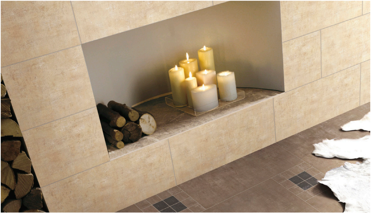
NOCE / BEIGE