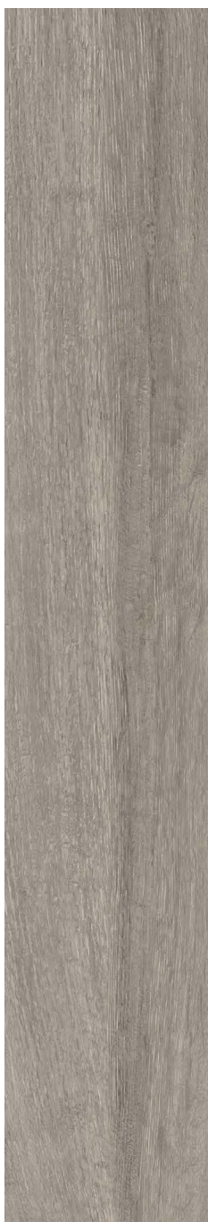
GRIS (Grey) - Matte

20 x 120 cm (7.874" x 47.244") DN.CP.NAT.0848.MT