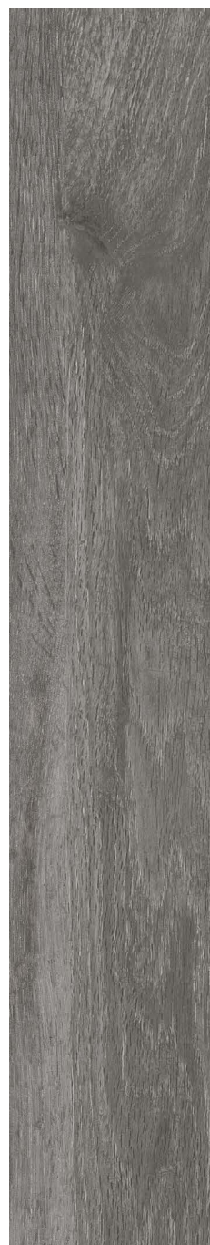
ANTHRACITE - Matte

20 x 120 cm (7.874" x 47.244") DN.CP.GRI.0848.MT